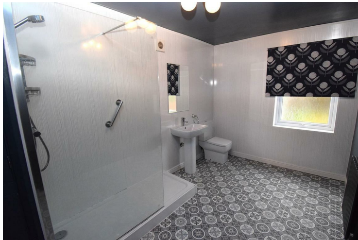
Shower Room 13'11" x 7'10" max. (4.25 x 2.39 max.)

Stylish three piece suite comprising generous walk in shower, wash hand basin and WC. With a radiator, extractor vent, boiler cupboard housing the wall mounted combination boiler and a double glazed rear window.